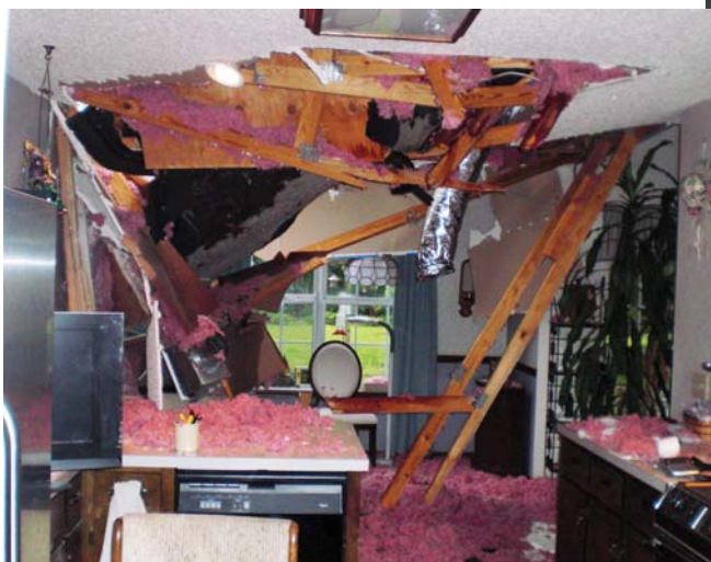
Photos: Damage to a home in Pace from a downed tree caused by straight line winds on June 29, 2008.