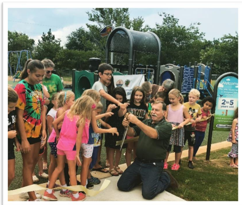
Optimist and Chumuckla Parks complete